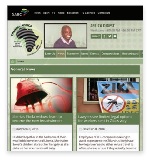
South African Broadcasting Corporation

....The consequence is that today, most state-owned broadcasters in southern Africa are financed commercially, (including some donor sponsorship). They deliver mainly government service content, with patches of public service content in varying degrees. In most African countries, these institutions remain the biggest players in broadcasting, and they are formidable forces in contributing to—or at the other extreme, working to counter progress in democracy and development.<sup>26</sup>