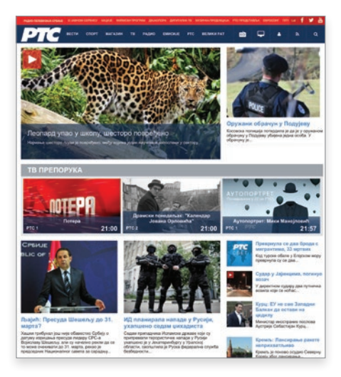
Radio Television Serbia

When it comes to international media assistance aimed at democratizing media, support for the development of public service broadcasting has long been part of potential policy choices that aid providers can endorse and help to nurture. Early examples of such support were led by American and British forces in Germany and Japan in the aftermath of the Second World War. In both cases, foreign aid and military interventions were used to create what are now arguably two of the most successful examples of PSB in the world—Germany's ARD and ZDF as well as Japan's NHK.<sup>16</sup> In both cases, the idea of developing a PSB was deemed essential to the act of nation-building.