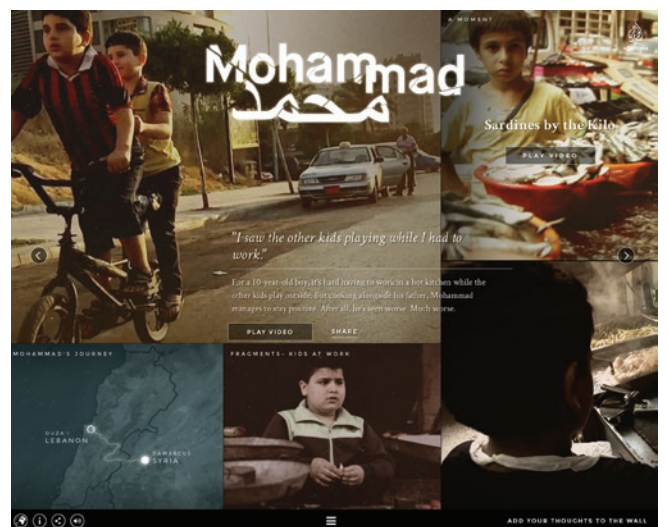
Al Jazeera’s interactive documentary Life on Hold .