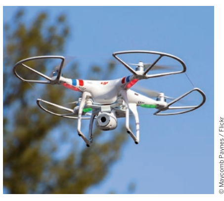
Left: Dandora dumpsite in the Nairobi suburbs Right: DJI Phantom 2 Vision drone