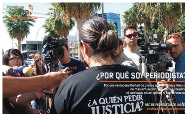
World Press Freedom Day 2016 posters, reading “Why am I a journalist?”

They also created a fake version of an independent magazine Luces del Siglo . The false version of the print magazine was distributed at points of sale and political events. Moreover, the digital version was altered more than 35 times, changing reports about corruption or material critical of the government to content favorable to the government.